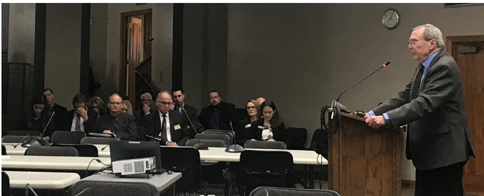
Senator Dwight Cook presents SB 2362 to the Senate Finance and Taxation Committee on March 13.