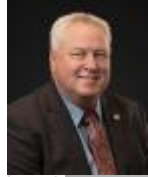
Sen. Donald Schaible, Chair